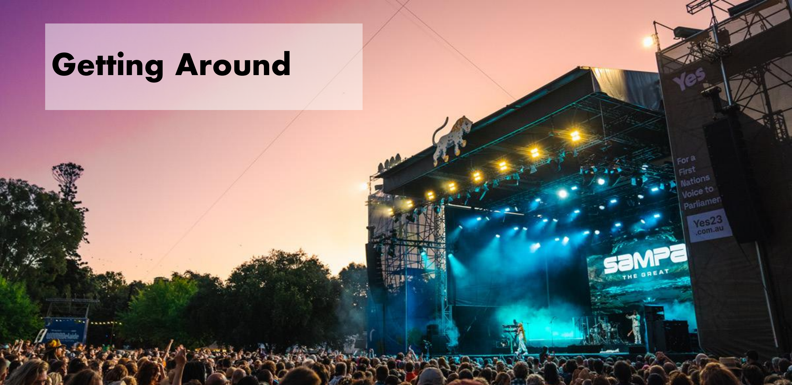
Image: A huge crowd stands in front of a gigantic blue-lit stage under a purple sunset.