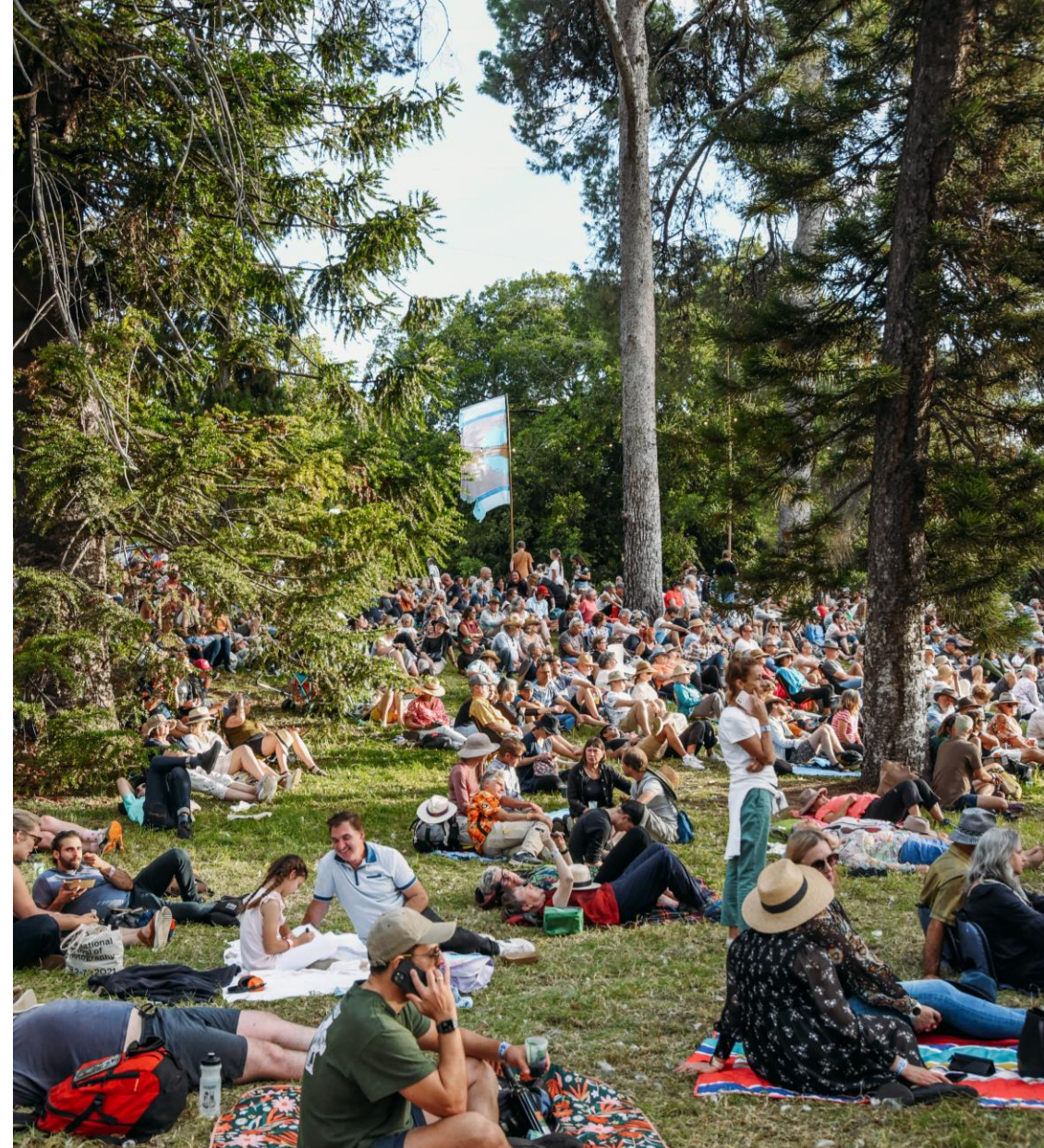
Image: A large crowd of people sitting on the grass on a hill.

Where a sealed pathway is not available to move between areas of the site, an unsealed clearway has been created to assist with moving through the site, this is marked on the map.