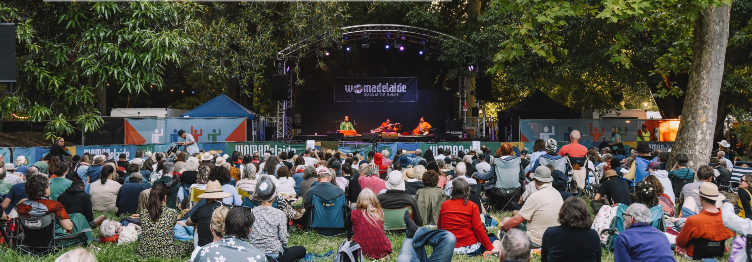
Image: A crowd of people seated on the grass watching a performance under the green leafy trees.