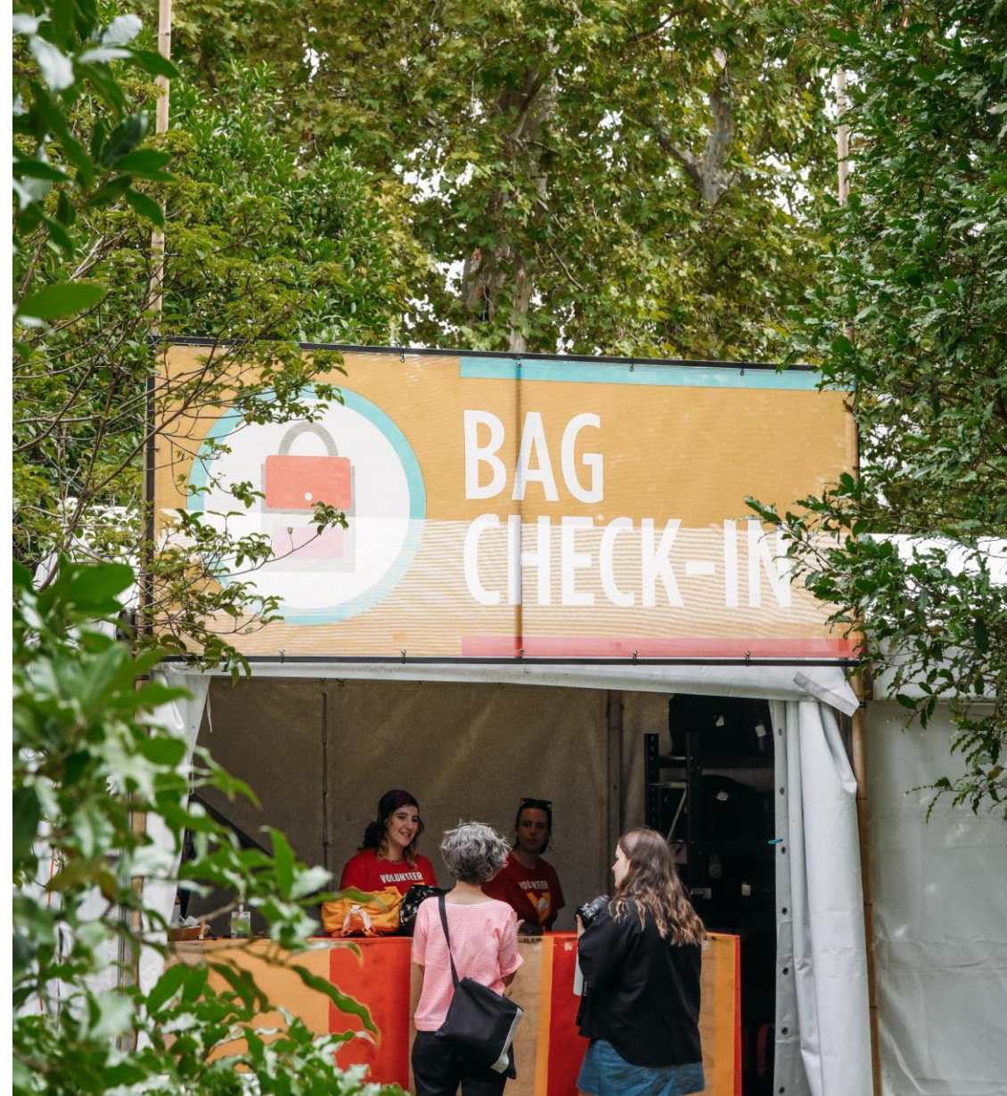
Image: Two people being served at the Bag Check-In.