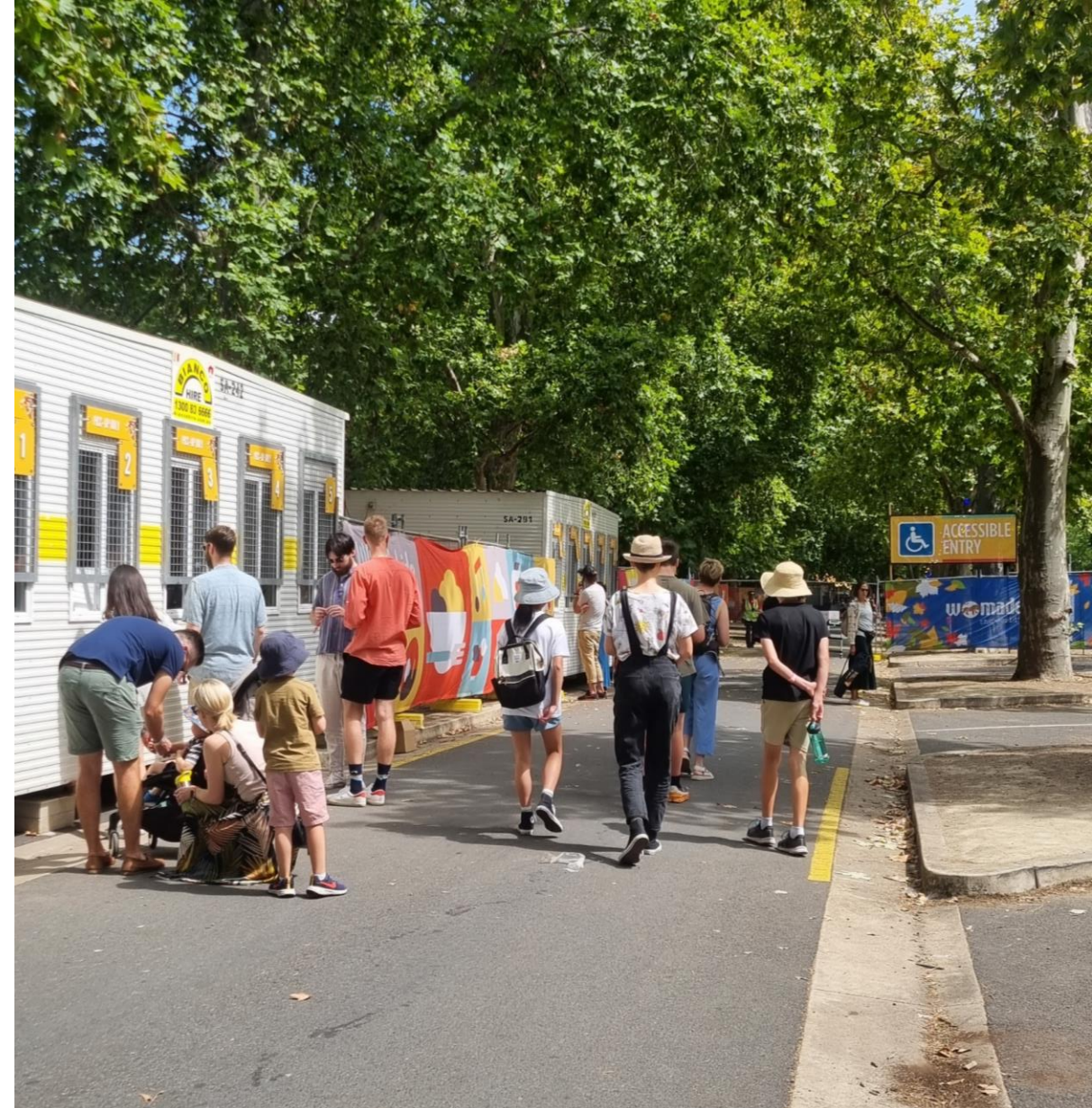
Image: People gather around the Hackney Road entrance.

Both areas have Box Offices, and staff who will scan your wristband and check your bags.