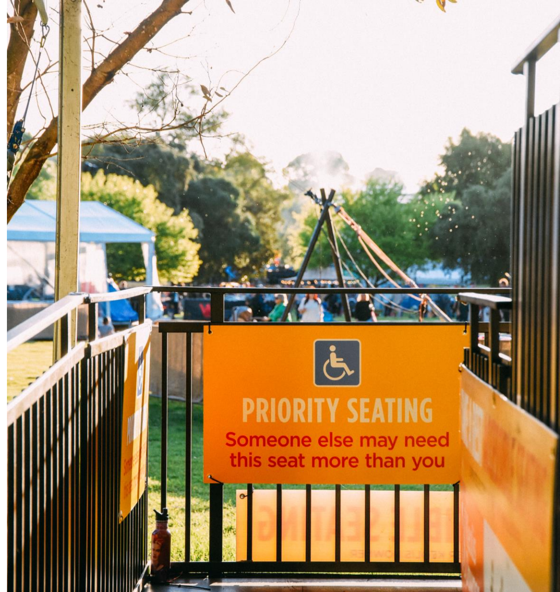
Image: A yellow sign on the access viewing platform that says, 'PRIORITY SEATING – Someone else may need this seat more than you'.

The access platforms can fill up quickly for popular shows, so plan to arrive ahead of time for performances.