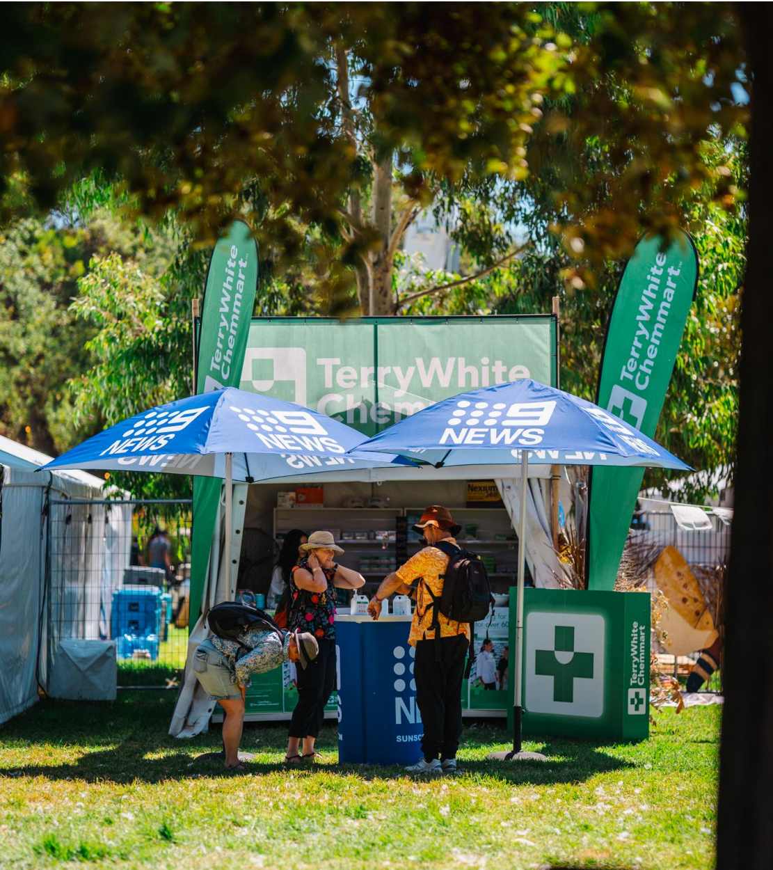
Image: A green TerryWhite Chemmart tent with people applying sunblock.