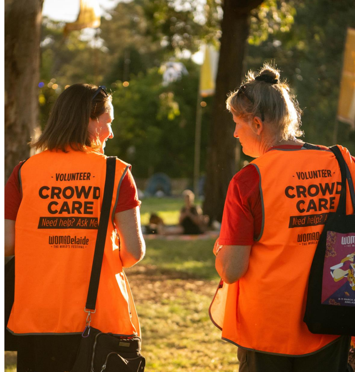
Image: Two volunteers wearing orange vests that say, 'VOLUNTEER – CROWD CARE – Need help? Ask me'.

Also, in 2024 a group of volunteers will complete an 'Access All Areas' online training by SupportAct about intervening when witnessing sexual harassment, assault, discrimination and bullying.