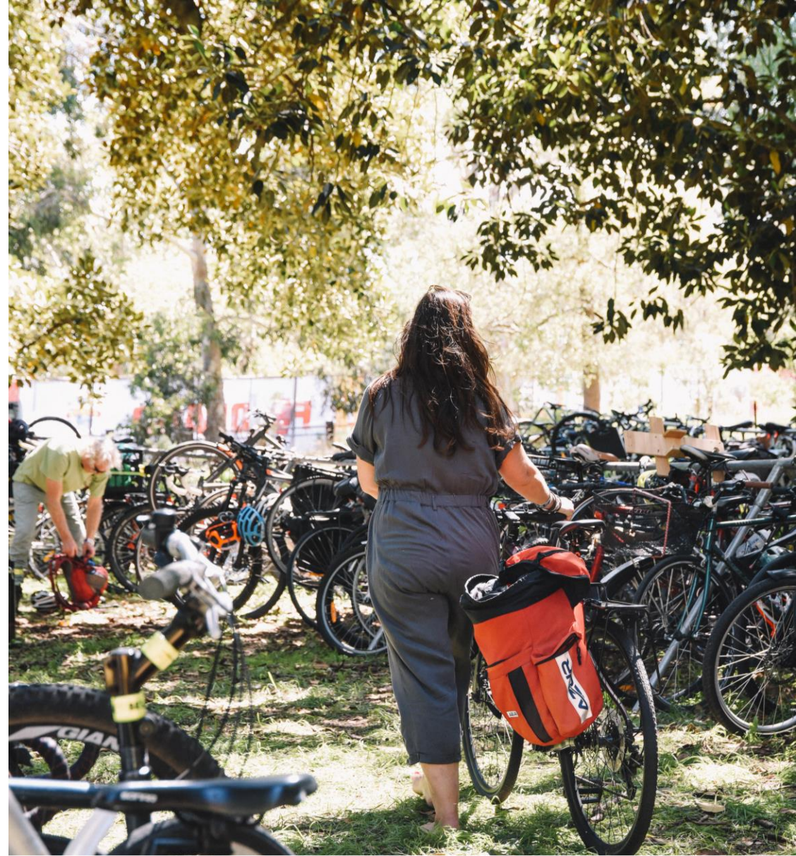
Image: A person walking with a bicycle in a grass area with many other parked bicycles.

City cycling maps are available HERE with maps 6 and 9 showing access to Botanic Park.