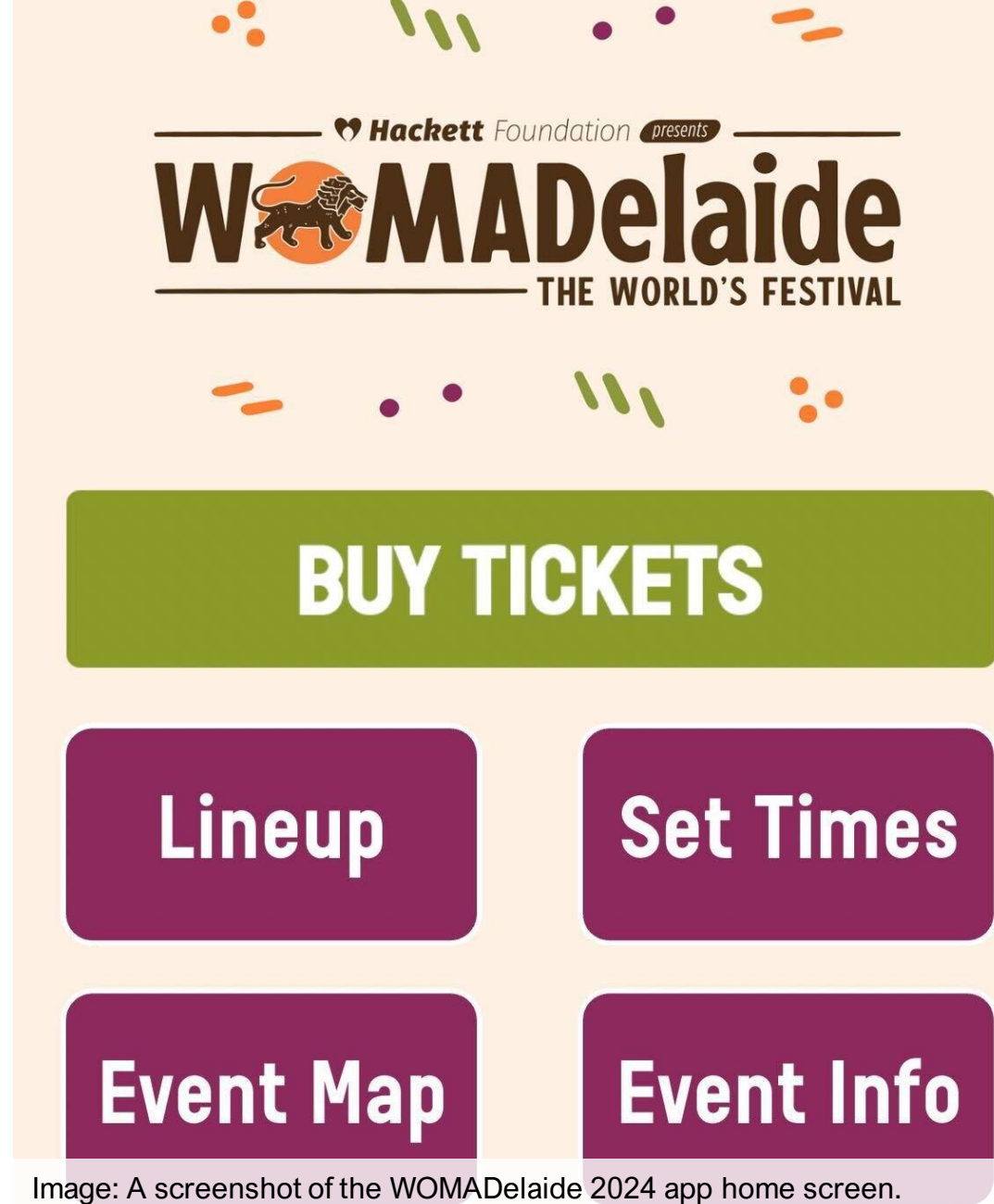
Image: A screenshot of the WOMADelaide 2024 app home screen.

You can also view the site map on page 22 of this guide or download it here .