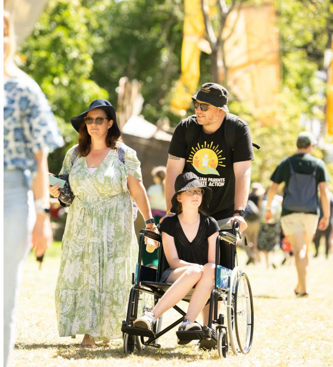
Image: A person being pushed in a wheelchair across the grass.

There are details in the pages following about accessibility for people with asthma, details on the paths and surfaces, sensory information, and other facilities.