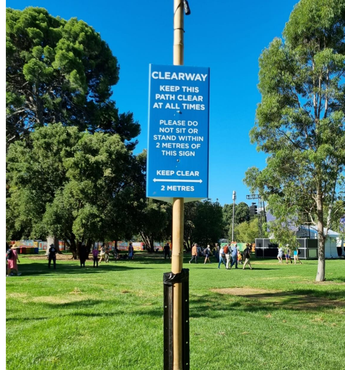
Image: A sign on a pole denotes this grassy area as a 2-metre-wide clearway.

At night the site can get quite dark in areas that are not busy, but there will be lights where the food, bars, toilets, and other amenities are, as well as lights for the path and across the park.