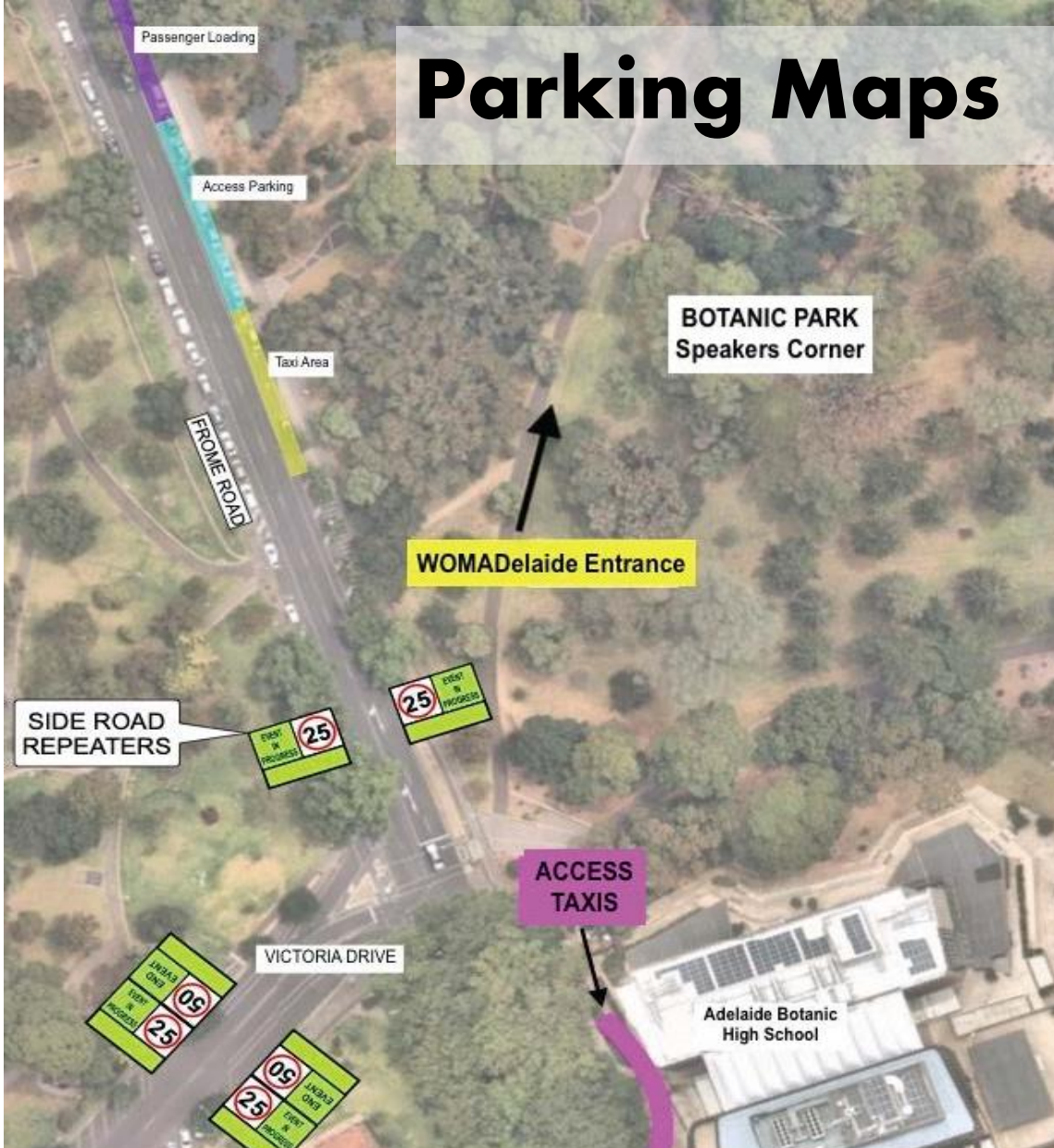
Image: Frome Road entrance, parking and taxi areas