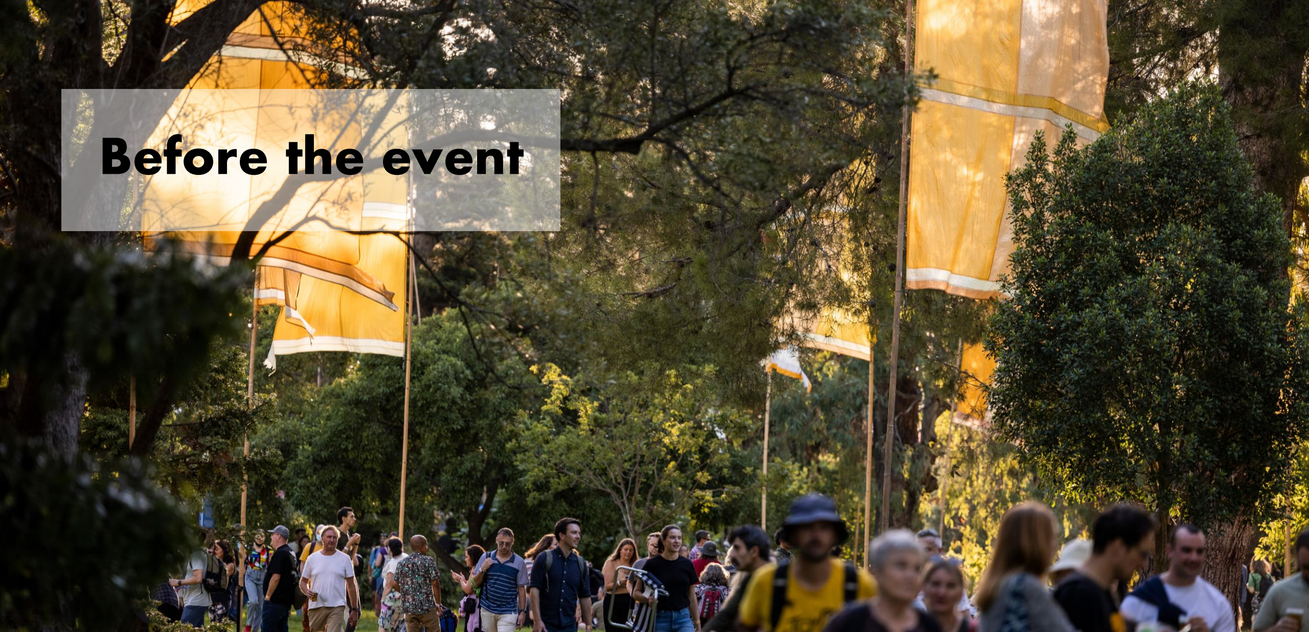
Image: A crowd of people walking under yellow flags and a canopy of trees.