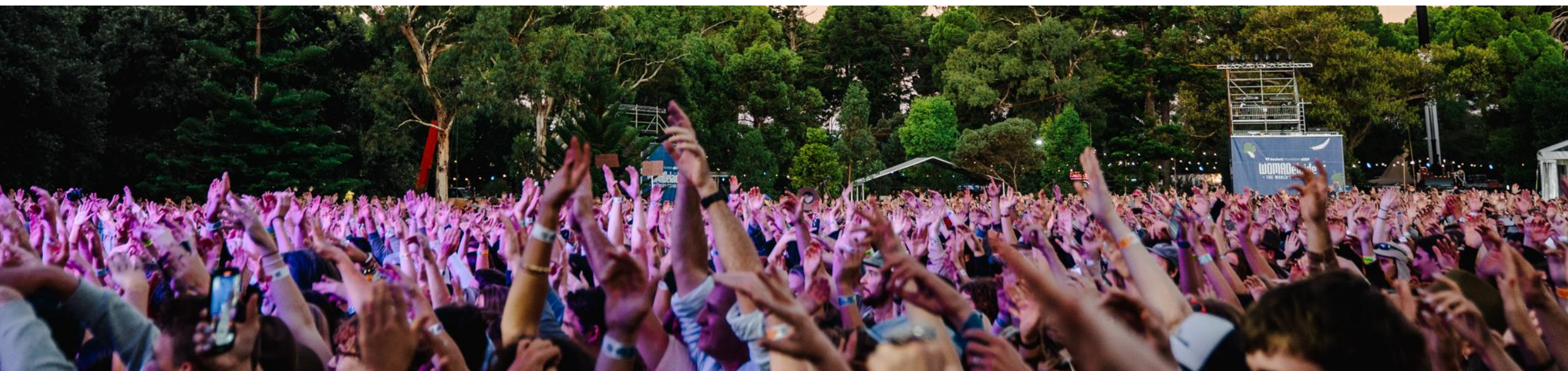
Image: A very large crowd dancing with their hands in the air, with large trees in the background.

If you have feedback on this Access Guide, please let Access2Arts know via hello@access2arts.org.au or by calling (08) 8463 1689.