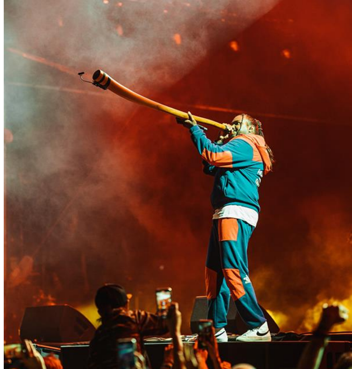
Image: Baker Boy playing the didgeridoo, wearing a blue and orange tracksuit.

There are also pop-up performance locations at Adelaide Botanic High School's gym and plaza, KidZone, Streb Extreme Action, and RoZeO – Gratte Ciel. As well as roving performances around the park each day. All stages and locations are marked on the map.