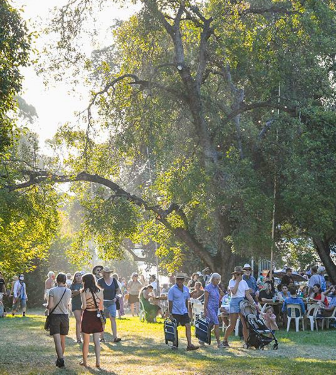
Image: Many people gather under large, leafy trees.