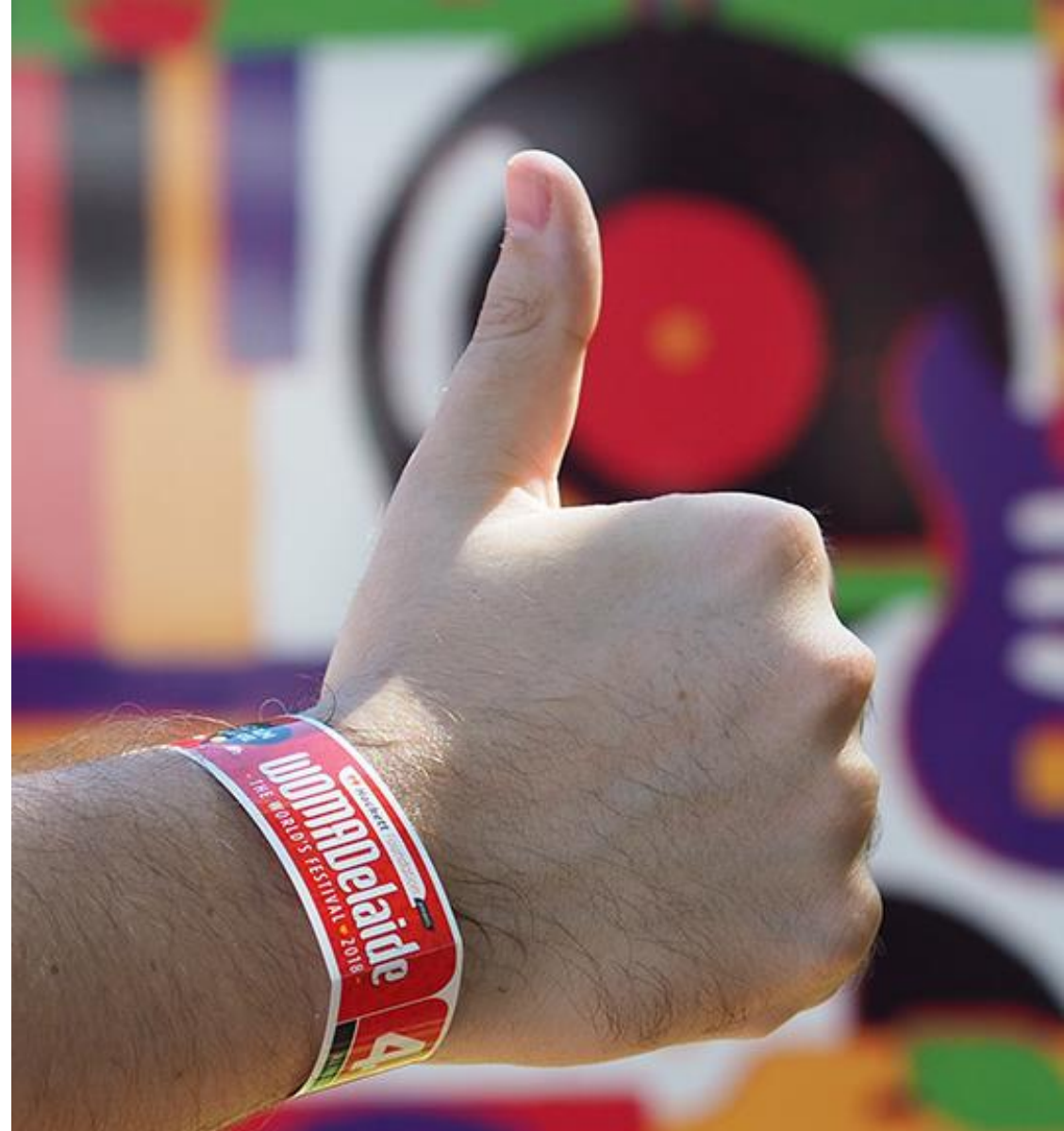
Image: A hand doing a thumbs-up, wearing a red WOMADelaide wristband.

To leave and come back, you must scan out and scan in again at the entrances.