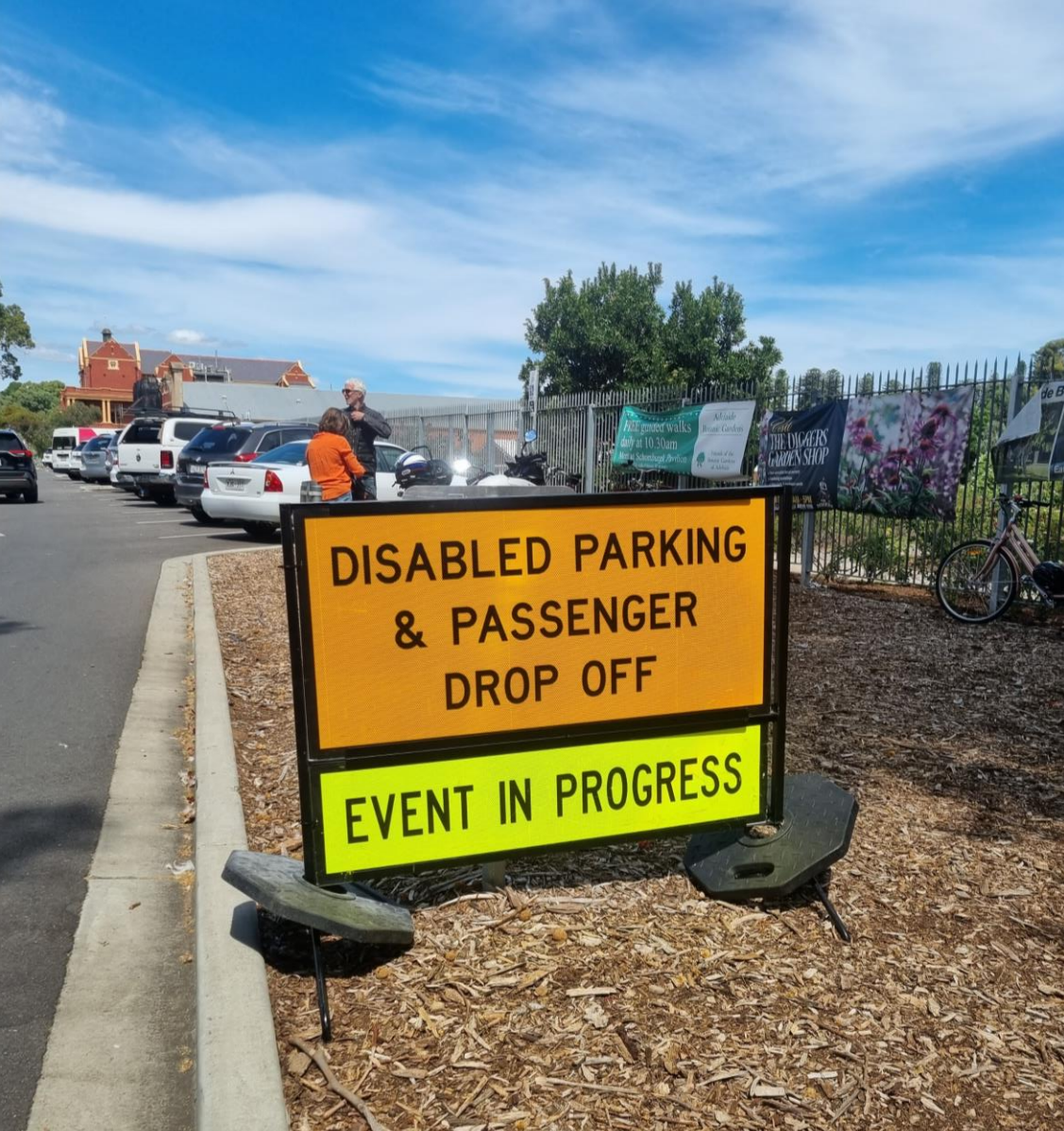
Image: A sign next to a car park reading “Disabled Parking & Passenger Drop off – Event in Progress”

Access taxi bookings can be made through Suburban Taxis by calling 1300 360 940.