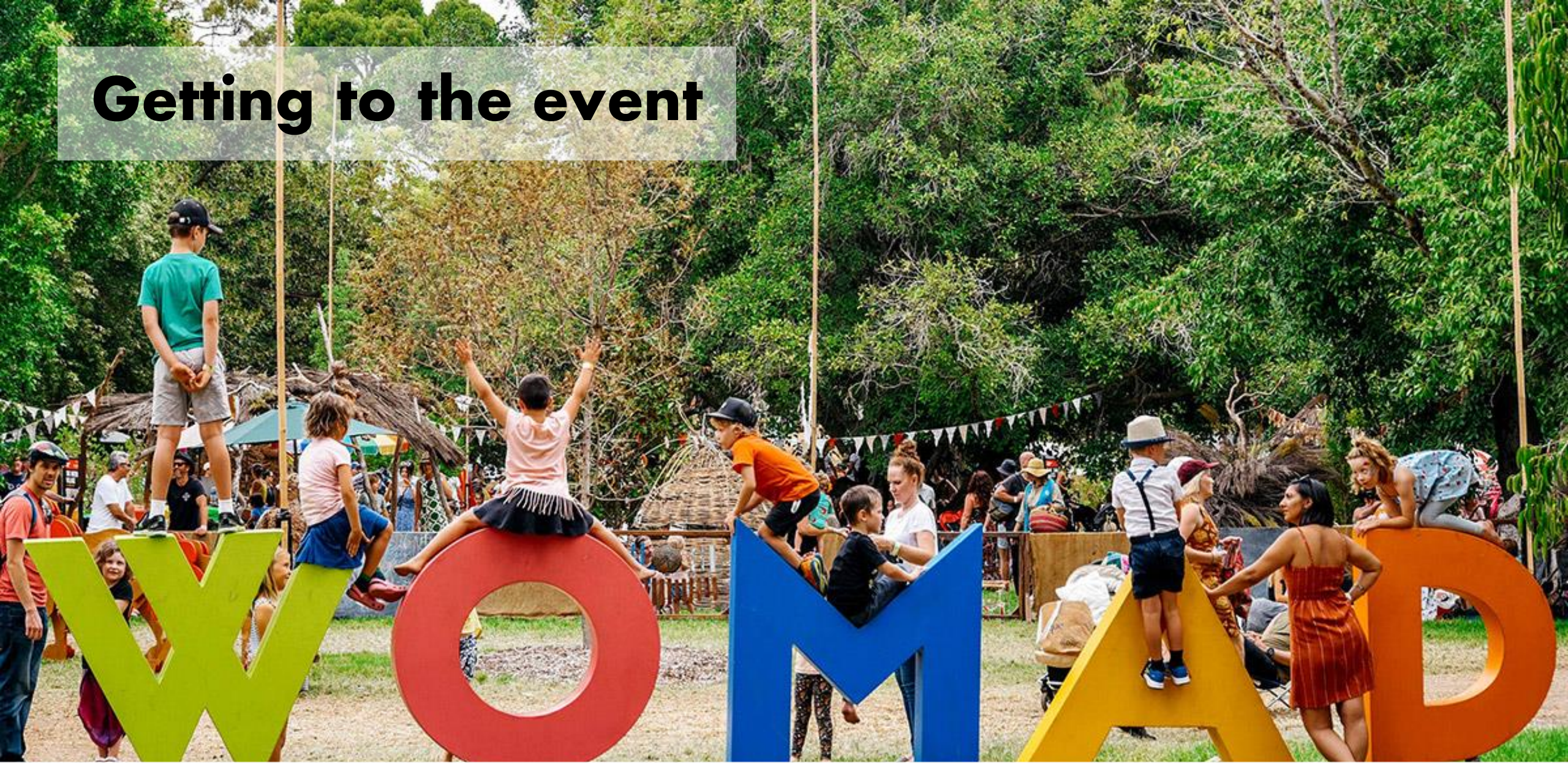
Image: Lots of children play on large sculptural letters that spell “WOMAD”