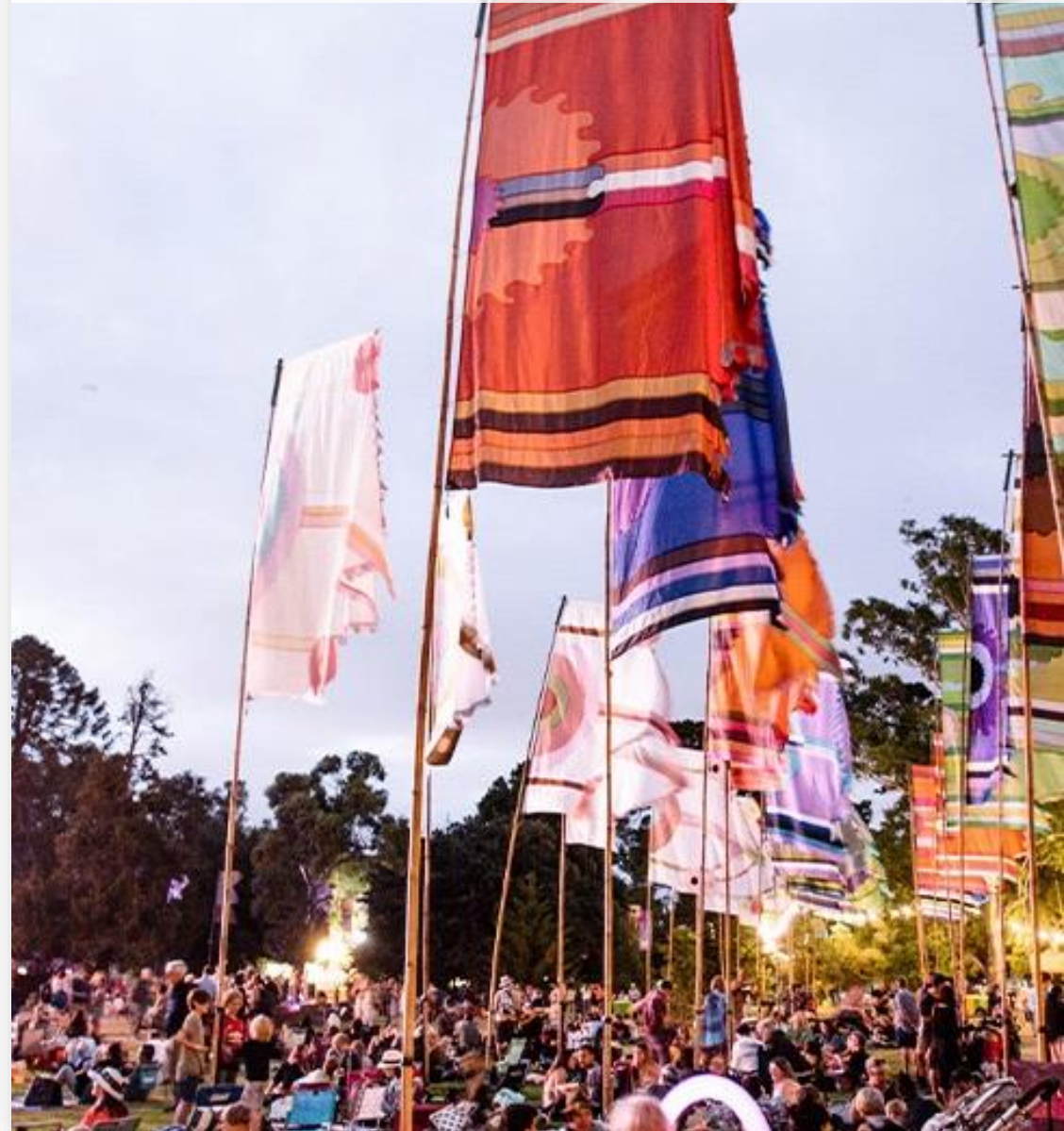
Image: A crowd of people stand and sit beneath tall colourful banners

If you have any other access questions, please contact tickets@womadelaide.com.au .